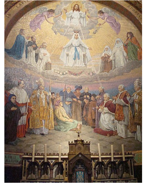
Inside Rosary Chapel—The Crowning