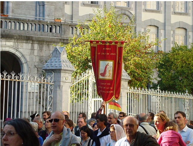
Pilgrims in Procession