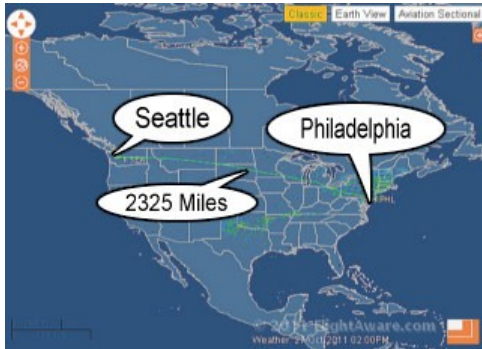
Seattle to Philadelphia 5 hours 5 minutes