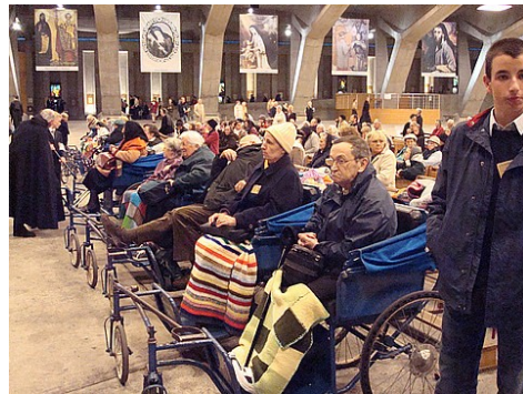
Inside Basilica of St. Pius X