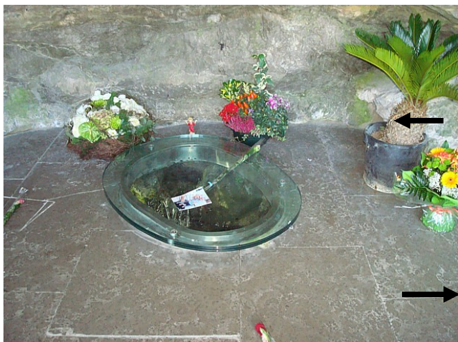
Spring in Grotto