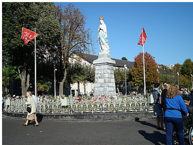
Blessed Virgin Statue