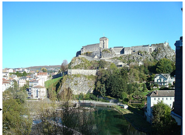
View From My Hotel