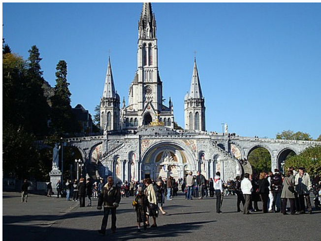
Sanctuary of Our Lady of Lourdes