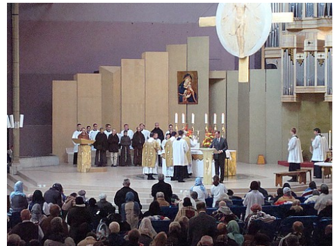
Solemn Mass inside Chapel of St. Bernadette