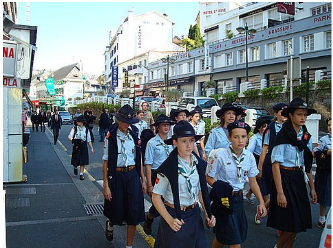
Pilgrims in Procession