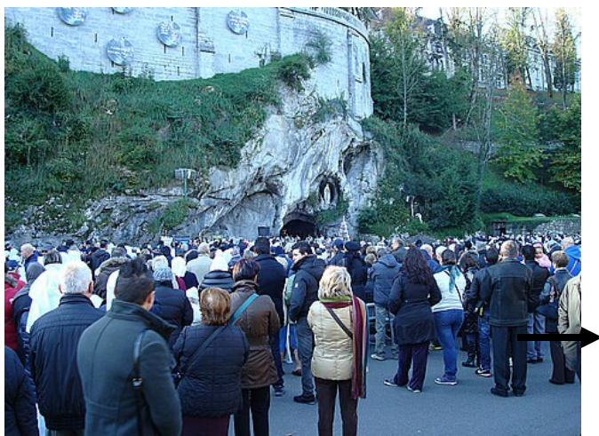
Pilgrims at Grotto