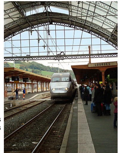
French Rail to Lourdes 1 hour 25 minutes