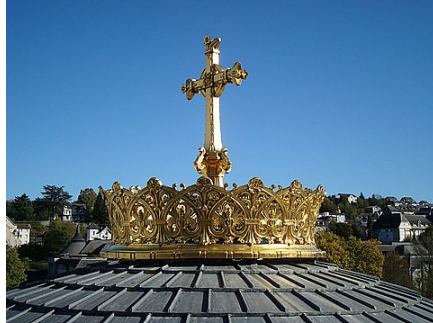
Atop Rosary Chapel