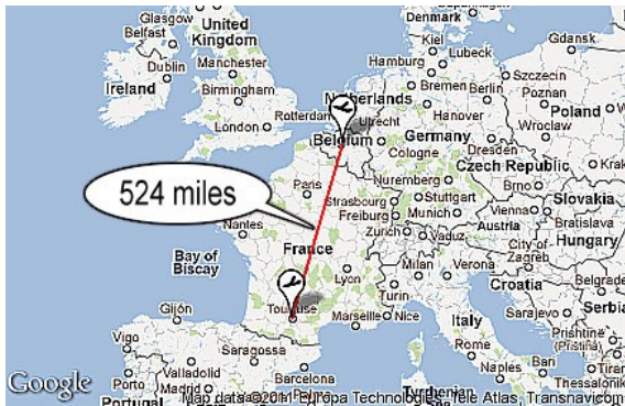
Brussels to Toulouse 1 hour 28 minutes