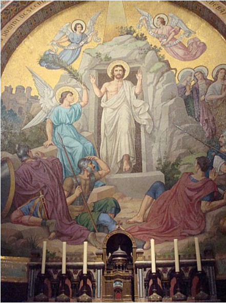
Inside Rosary Chapel—The Resurrection