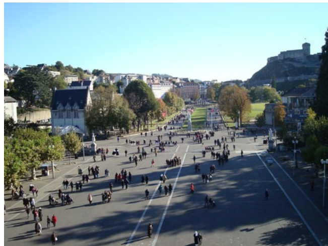
View From Esplanade