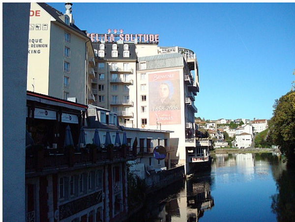
My Hotel in Lourdes La Solitude