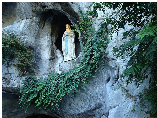
Blessed Virgin In Grotto